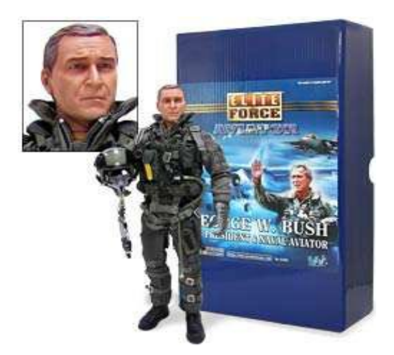
War weary troops were kept circling at sea off the coast of San Diego in order to make Bush's photo-op landing more spectacular

According to the trade publication PR Week, the [a group of public relations specialists hired by the Pentagon] sent "messaging advice" to the Pentagon. The group told ... Rumsfeld that in order to get the American public to buy into the war on terrorism they needed to suggest a link to nation states, not just nebulous groups such as al-Qaeda.